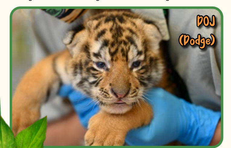
Each session began with warm water massage followed by flexibility exercises and then walking/ placement exercises.