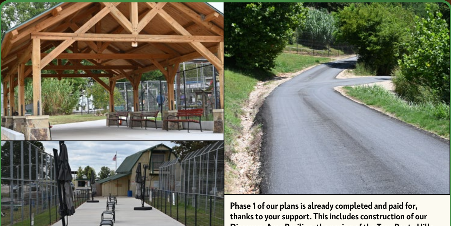
Phase 1 of our plans is already completed and paid for, thanks to your support. This includes construction of our Discovery Area Pavilion, the paving of the Tour Route Hills to lower noise and dust, and pouring concrete in the Discovery Area Walkways.

Over the next three years, we plan to make considerable improvements to our supporter's experience while visiting the Refuge. The aim of our plan is to uphold our goal of continually improving the quality of lifetime care for the animals we rescue, while taking the steps to secure their future.