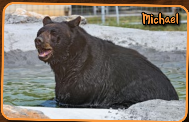
An easy way to put a smile on the face of every lion, tiger, and bear is to sign up for Amazon Smile Charities at smile.amazon.com. Just search for "Turpentine Creek Foundation, Inc."