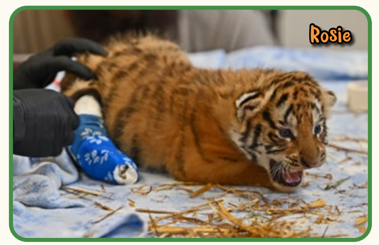
After the morning session, their little limbs were splinted into proper position until the afternoon therapy.