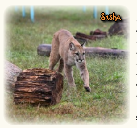
Sasha cougar continues to blossom following her rescue from a Bronx apartment. She loves darting around her habitat and "chirping" at guests!

Sasha can be seen enjoying her various enrichment items in the habitat most of the time. She is routinely spotted running, chasing, and greeting our staff photographer, while offering friendly and cheerful high-pitched chirps to her animal care team! She also seems to enjoy onlookers, responding to their presence with various positive vocalizations such as purring. It's such a joy to witness this happy girl making the most of every day, and exercising her new-found freedom!