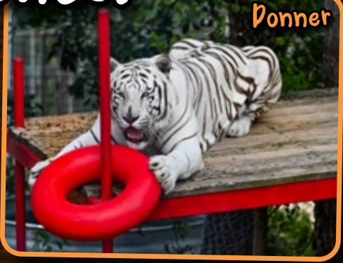
Thank you to everyone who treated our big cats to new toys during the holidays!