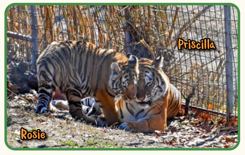
It's taken a lot of time, effort, many staff members, one trusting tigress, and three tough little tiger cubs.