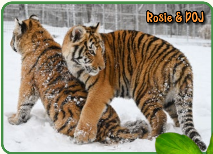
The cub's recovery was miraculous, and they are doing well to this day.