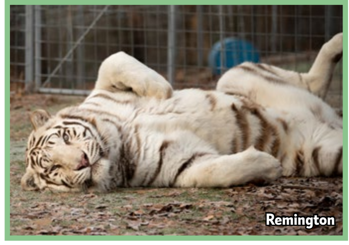
January, a federal court judge finally granted placement for Luna and Remington after a three-year court battle. Today, after safely neutering Remington, the chuffy pair clearly enjoy each-other's company.