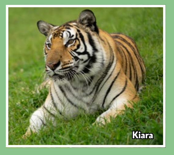
In February, we rescued Naula and Kiara from a small closing facility in Oklahoma. Their owner told us that they came from another facility in Oklahoma that was "not a good place to grow up." They quickly adapted to their new grassy home.