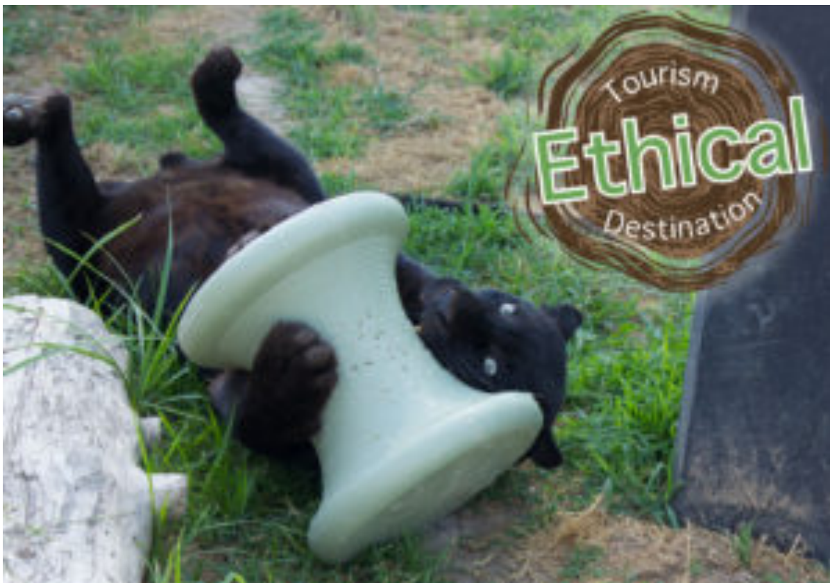
Turpentine Creek Wildlife Refuge is hard at work to change the lives of visitors along with our animals!