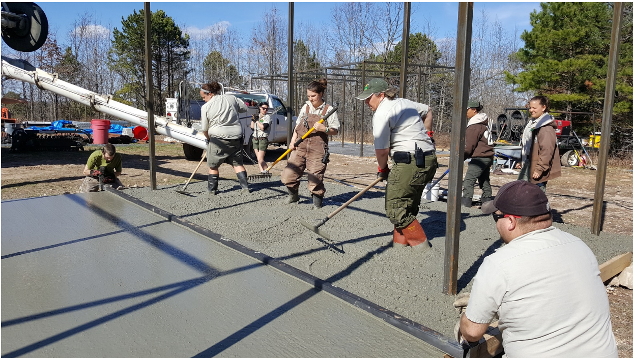
TCWR staff and interns work to finish night house slabs for our new 3.5 acres of natural bear habitat which opened in October of 2018 after a year of hard work for six delighted bears.