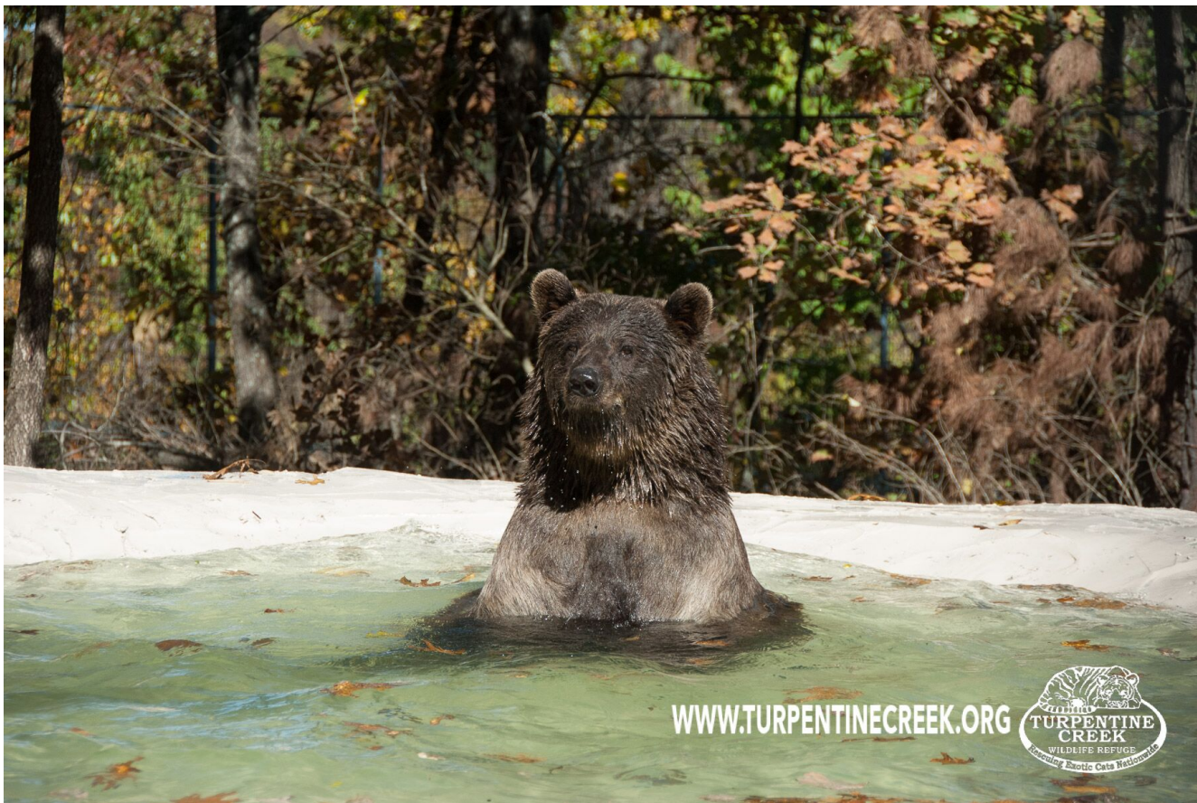
Huggy, a Russian Brown bear, thoroughly enjoyed the in-ground pool he discovered in his new natural habitat shared with black bears Holli and Lolli.