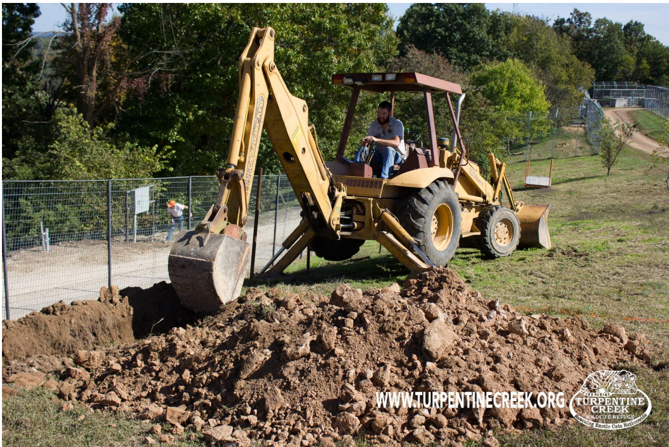
Breaking ground on our new serval habitat, which will open in Spring of 2019.