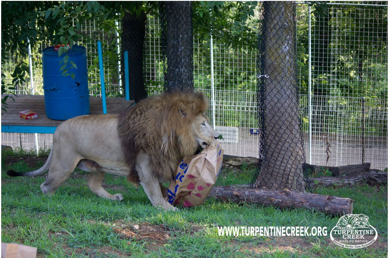
Tsavo on World Lion Day, enjoying some special enrichment items!