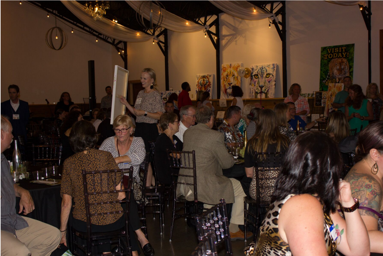
Our inaugural Sipping for Sanctuary fundraiser in September was filled to capacity with donors enjoying live music and auction, delicious food, and wine.

In August we introduced our Ethical Tourism icon, letting you know you have chosen a destination that works hard to have a positive influence on our ecosystem, environment, wildlife, local people, and local economy.