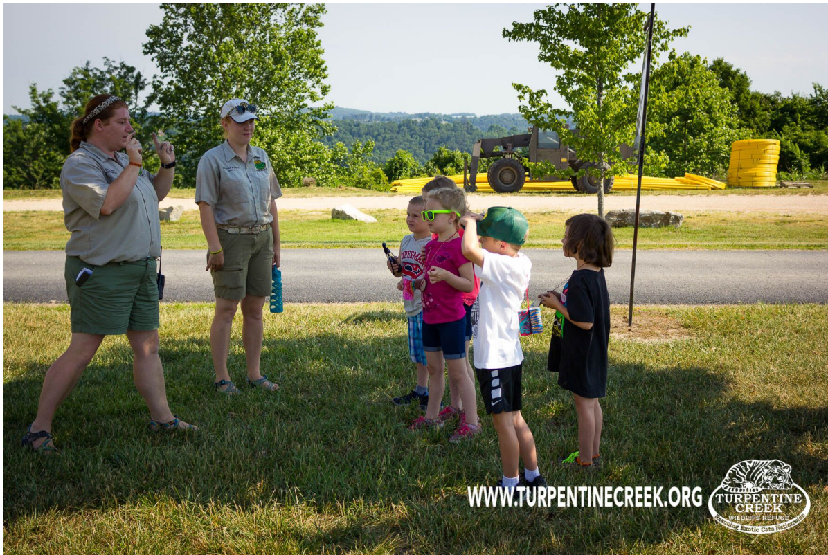
And in scavenger hunts, searching for facts among the educational wayside signs throughout the Refuge.