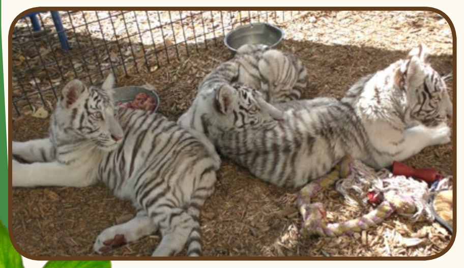
If they survive, they will eventually grow too big to be handled. At that time they are no longer profitable and their fate is questionable.