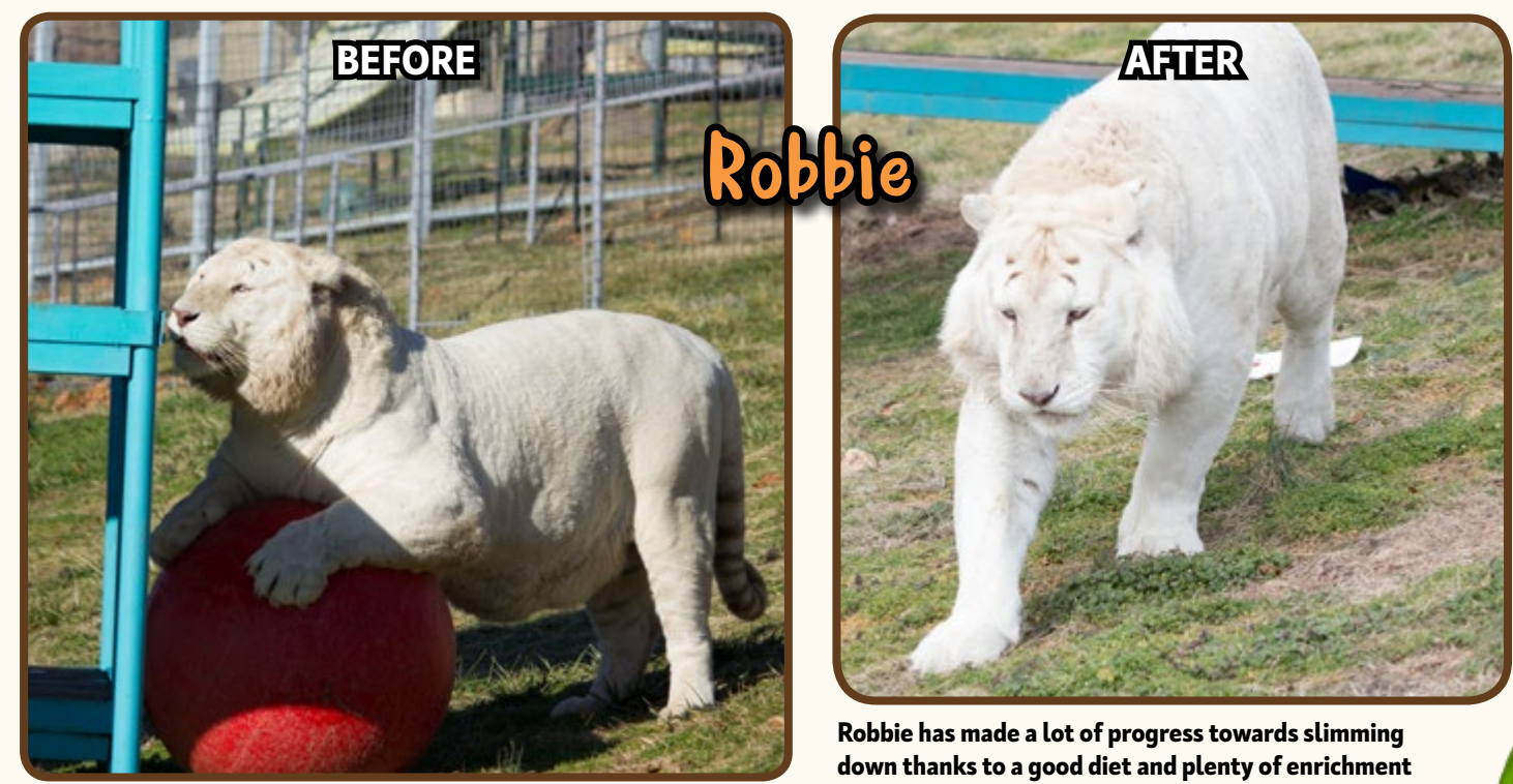
Robbie's first day in his new habitat at Turpentine Creek. When he arrived he was morbidly obese and struggled to get around his habitat.

Tigger, Floyd, Frankie, Tommie and Robbie are adjusting well to their new lives at Turpentine Creek. They love all the enrichment the team is providing and are starting to gain trust in their caregivers. As always, it inspires us to see the progress the five tigers have made since their arrival. We cannot wait to discover what the future will bring for them. It is only with your help that we can continue rescuing big cats and survivors of the Exotic Pet Trade. Thank you!