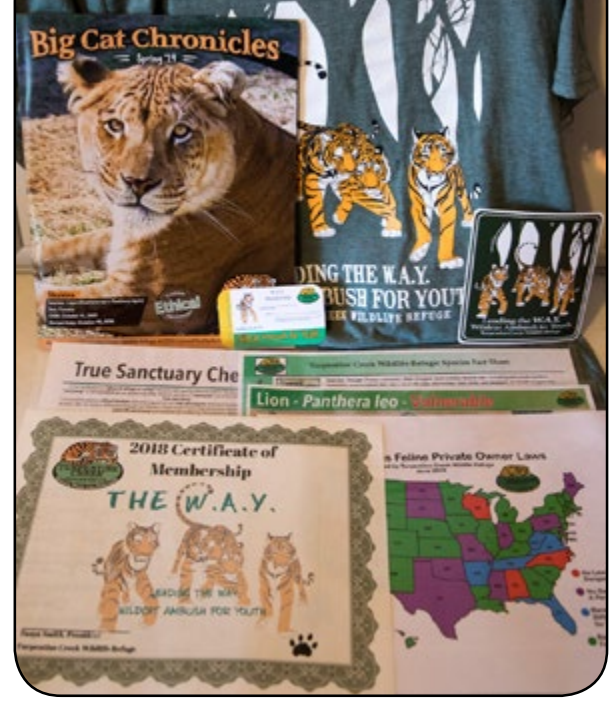
W.A.Y. (Wildcat Ambush for Youth) Benefits