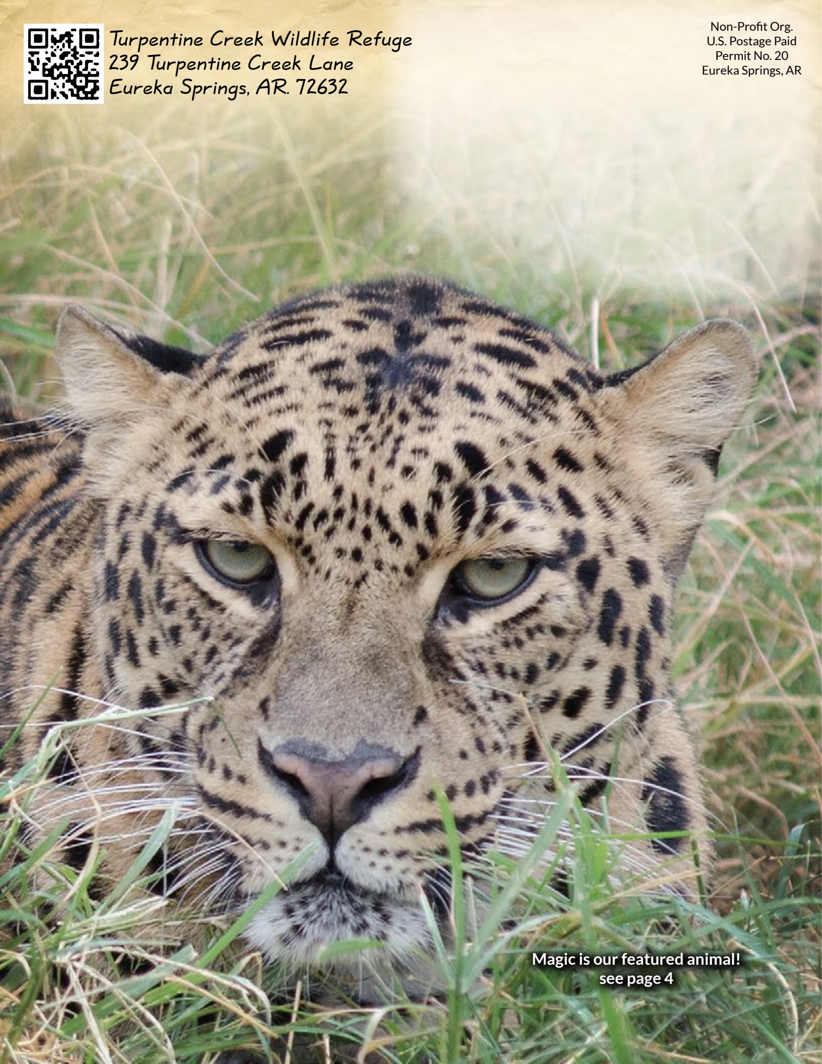
Magic is our featured animal! see page 4

Non-Profit Org. U.S. Postage Paid Permit No. 20 Eureka Springs, AR