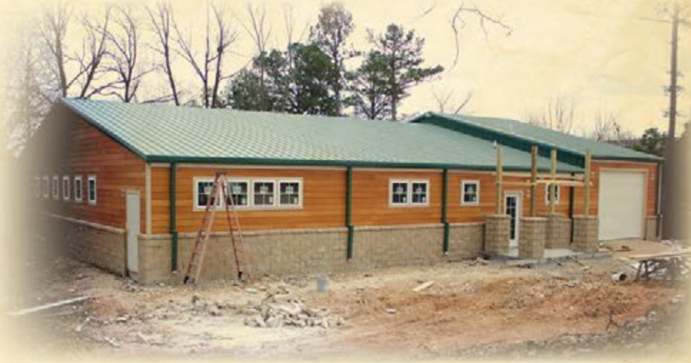
The Vet Hospital will be finished soon, but will not be fully equipped until we complete the fundraising. We still need $73,428 to purchase all of the equipment needed to care for our big cats and bears onsite. Can you give to the future of big cats and bears everywhere? See the enclosed envelope.