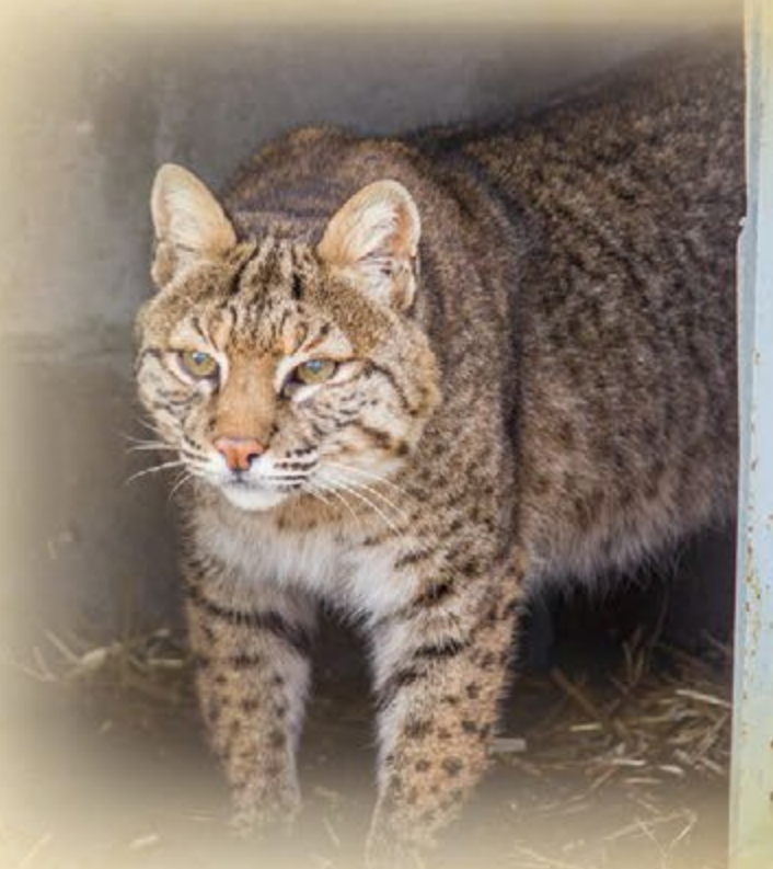
In the wake of the Zanesville Massacre, Bobby, a 17-year-old bobcat, finds refuge at Turpentine Creek. As new dangerous animal laws are passed across the nation, animals will be put in undesirable situations. We are here for them. Donate today.

We encourage you to visit Bobby at the Refuge to learn more about the harmful nature of the exotic pet trade and how you can help put an end to the ruthless practice of owning, breeding and selling exotic animals. And if you'd like to champion our mission, please consider spreading awareness, and donating to support future rescues and the daily needs of our animal residents.