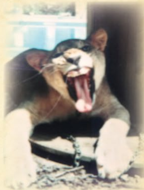
The Turpentine Creek Wildlife Refuge founding family first rescued Bum in 1978. Through this effort their eyes and hearts were opened to the understanding of the need for a lifetime home for unwanted big cats and bears.

(For those that may not know what we're talking about, sweetgum trees have a round seed pod – about the size of a golf ball – with spines like a blowfish. The pods are as bitter as gal, and when dry, as prickly as a porcupine! No cat is going to eat one of them and surely no lion would. Lions are carnivores that demand fresh meat at every meal; these guys won't even eat meat that has started to taint. In fact, lions really don't like it when meat dehydrates in the sun. How do I know these things and the local vet doesn't? Perhaps that is another chapter or maybe even another book all together. Let's just say that I know.)