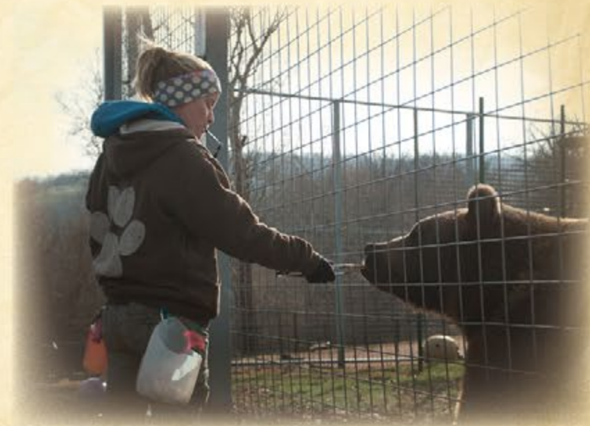
Training the animals for medical and check-up procedures will help us, help them.